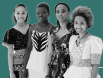
→ Harambee volunteers