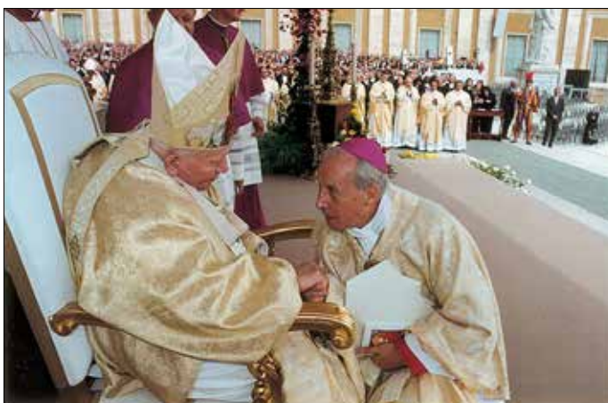
Msgr. Javier Echevarria greets Pope John Paul II after the canonization rites of St. Josemaría Escrivá.