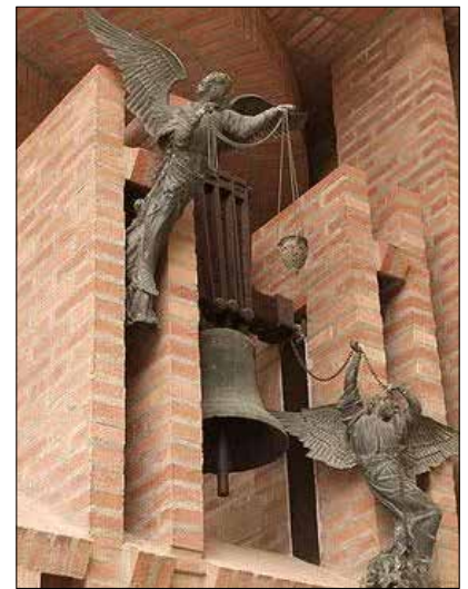
The photo (above) shows the bell from the church of Our Lady of the Angels in Madrid, which Saint Josemaría heard ringing when he "saw" Opus Dei in 1928.