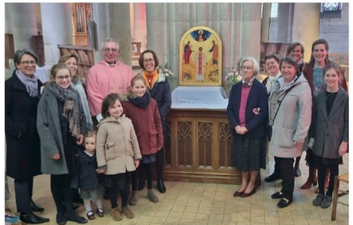
Installation of an icon of Saint Josemaría in Rouen (France)