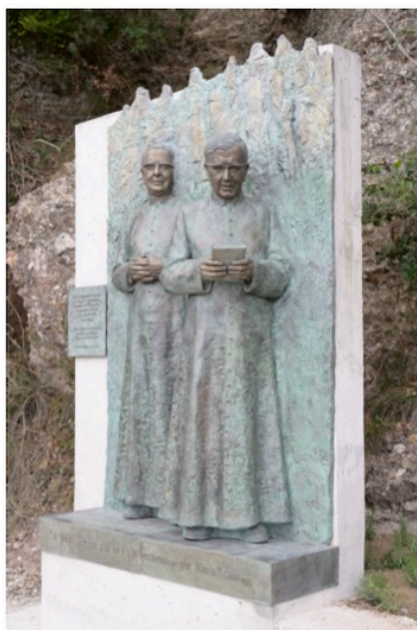
High relief of Saint Josemaría Escrivá and Blessed Alvaro del Portillo at the shrine of Montserrat (Barcelona, Spain)