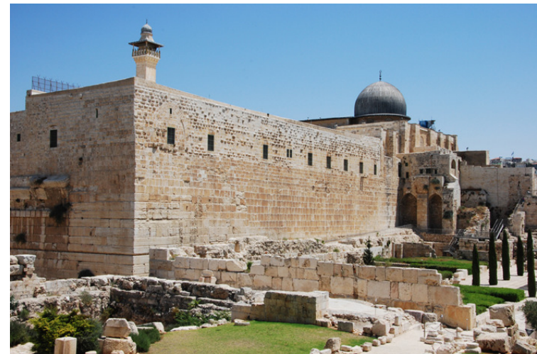
Pilgrims usually reached the Temple from the southwest.

The road from Bethlehem to Jerusalem follows the line of the hills gradually downwards. As they came close to the City they could see the Temple Mount standing against the horizon. Herod's builders had doubled the area of the courtyards and built enormous containing walls – some of them four and a half meters thick – around them, leveling the sloping ground by filling it with earth or supporting it on a series of underground arches. In this way they had constructed a roughly rectangular platform whose sides measured 485 meters on the west, 314 on the north, 469 on the east and 280 on the south. In the center, surrounded by another wall, was the Temple itself: an imposing structure 50 meters high, covered in white stone and sheets of gold.