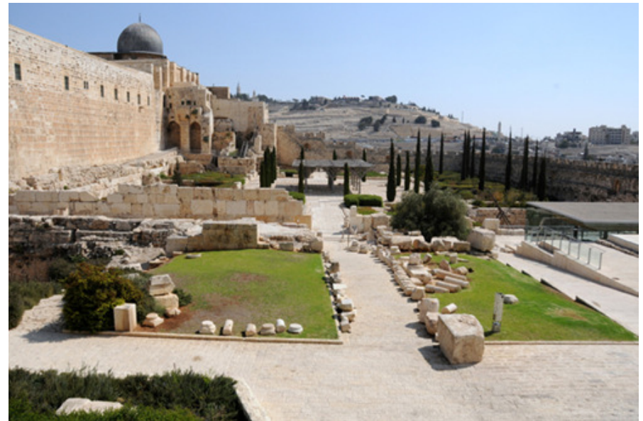
Area of archeological excavation to the south of the Temple Mount.

The road from Bethlehem led to the Jaffa Gate, on the western side of the city wall. From it a number of little streets ran in almost straight lines up to the Temple. Pilgrims would enter from the south flank of the Temple Mount. At the foot of its walls were plentiful little shops or stalls where St Joseph and Mary could buy the offering for the purification prescribed by the Law for poor people: a pair of turtle-doves or two young pigeons. Climbing one of the broad stairways and going through the entrance known as the Double Gate, they reached the courtyards through some monumental underground passages.