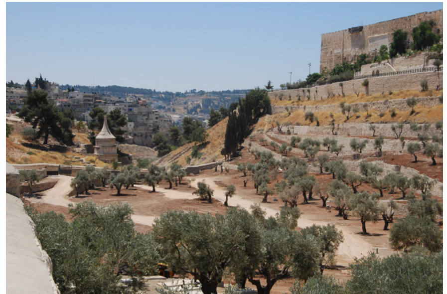
The Cedron river from the Mount of Olives.

The high ground, which stood an average of 760 meters above sea level, was girded by two deep rivers: the Cedron on the eastern side, separating the city from the Mount of Olives, and the Hinnom or Gehenna to the west and south. These two rivers joined a third, the Tyropoeon, which crossed the hills from north to south.